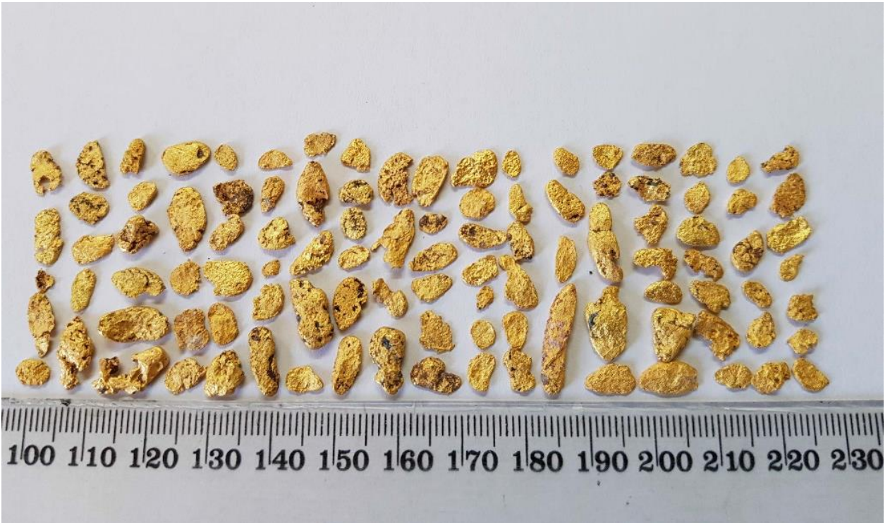
Figure 3: Nuggets from Location C2 the Just-in-Time Prospect (Nuggets are property of Haoma Mining)