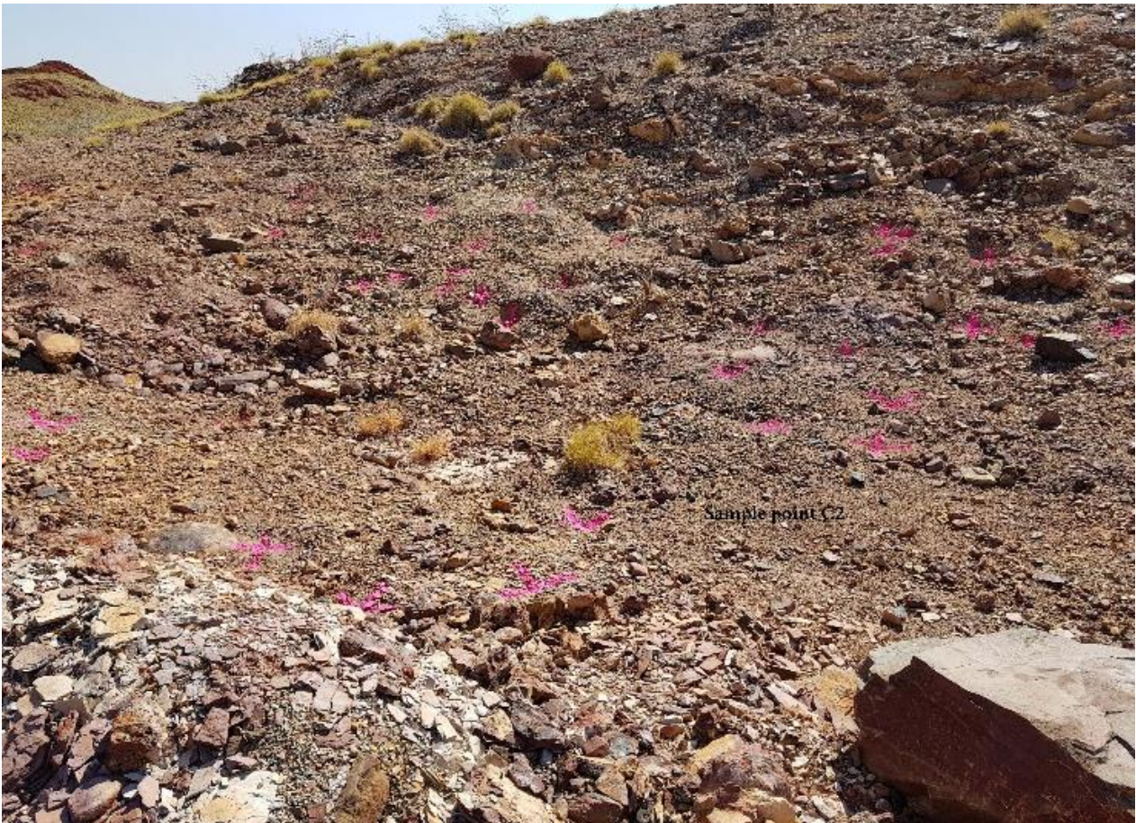
Figure 2: Location C2 the Just-in-Time Prospect – pink paint marks location of nuggets