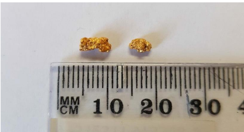
Figure 5: Nuggets from Location C3 the Tassie Queen Prospect (Nuggets are property of Haoma Mining)