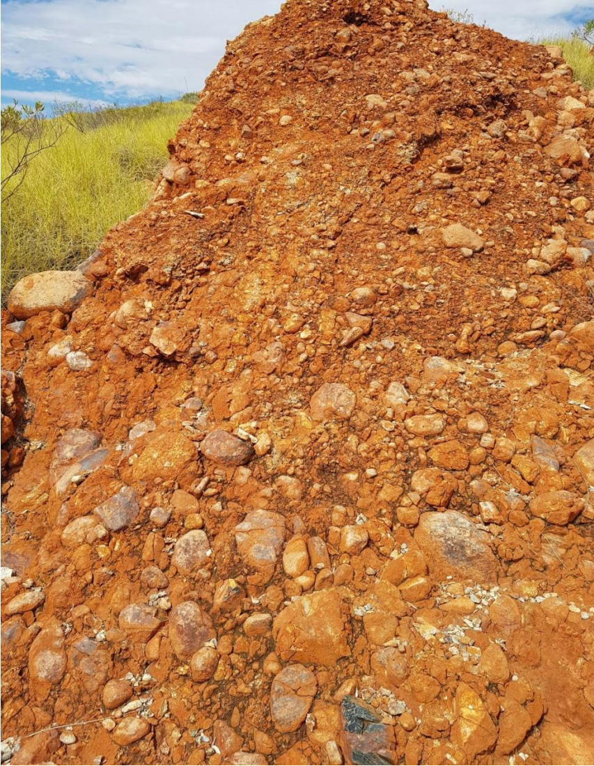
Figure 4: Location C3