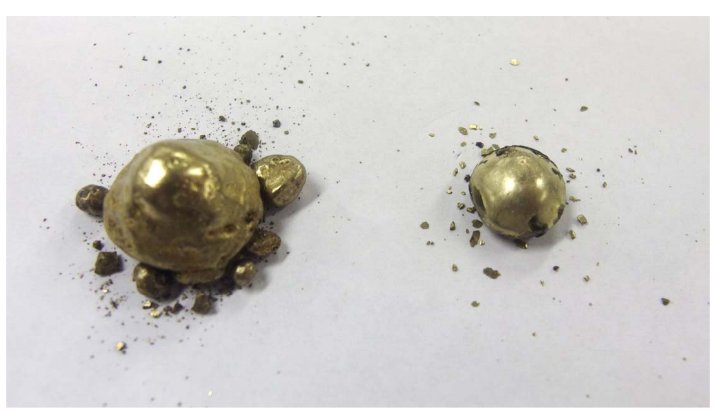
Gold and silver bullion (35.5g) measured by SEM at University of Melbourne